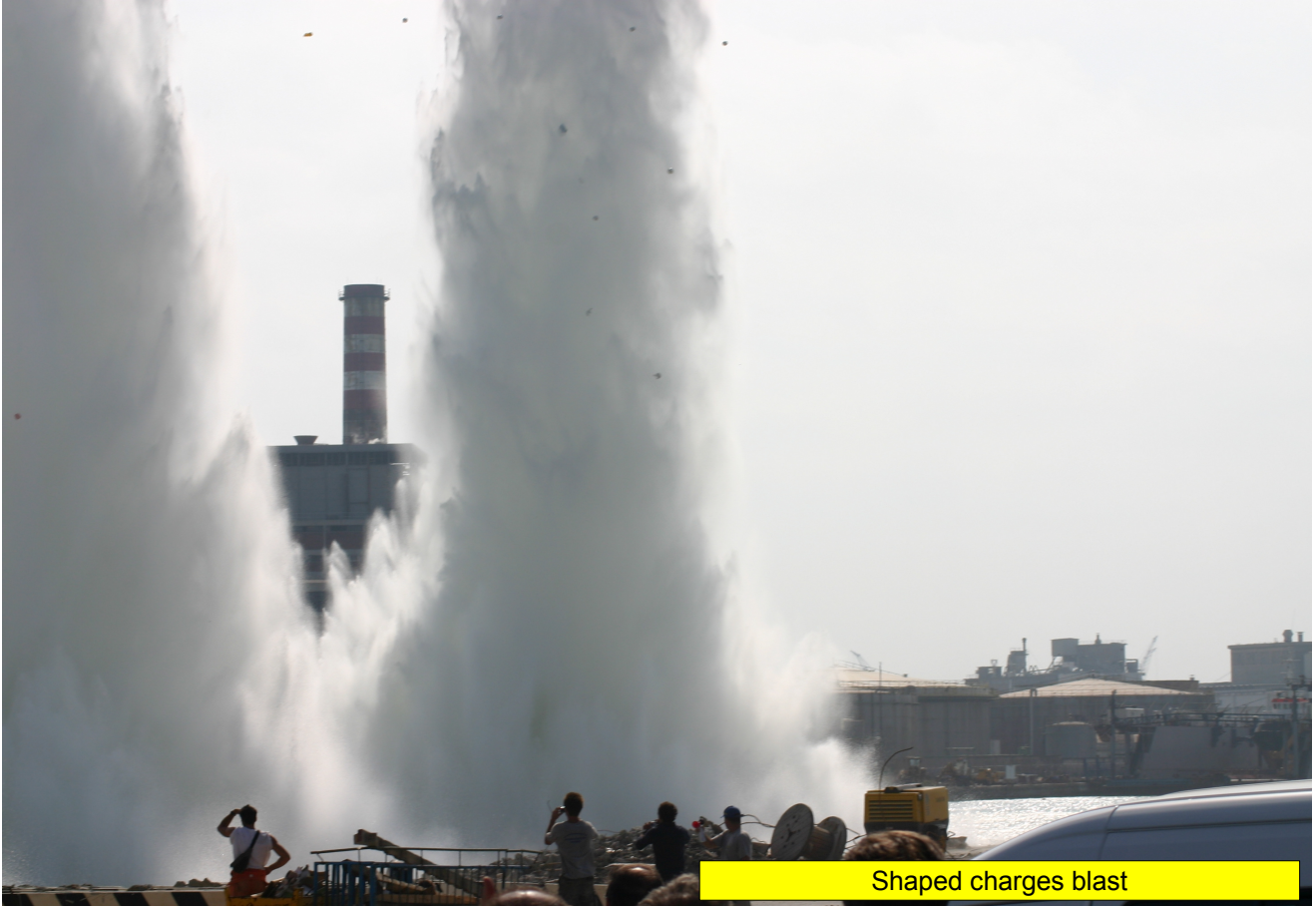
Shaped charges blast

Customer: IPC spa – Italy, year 2006/2007