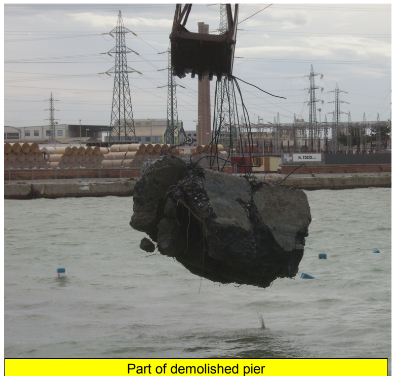
Part of demolished pier

Precautions were taken to minimize vibrations and overpressure in water, among this an air bubble curtain.