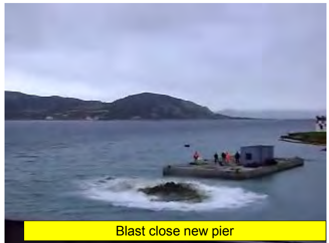
Blast close new pier

Underwater excavation of a granite formation for 4,000 m3 (5,230 cy) by shaped charges and explosives in blastholes. Project to host the G8 summit in La Maddalena Island – Old Arsenal.