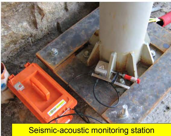
Seismic-acoustic monitoring station

NITREX_prtf 02-123 EN 2009 UWBL La Maddalena - pag. 1/1